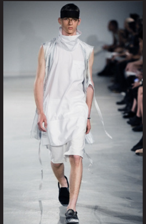
TOP, BOTTOM: S/S '14: Remorse